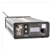
VOKKERO GUARDIAN CONNECT Wireless Interface (WI)