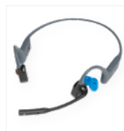
ASO 400 Bluetooth bone-conduction openear headset